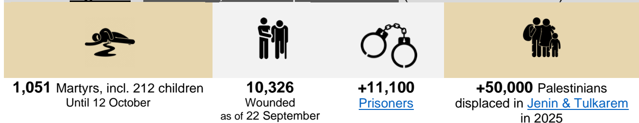
Figure 3: West Bank, incl. occupied Jerusalem | 13 October – 19 October 2025 (until 8 AM)