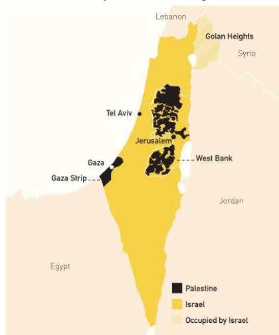
Figure 2: Palestinian enclaves in the West Bank

The PA's 2021-2023 National Development Plan as such, could be adopted by Australia to guide its own aid program. It also defers to Palestinian civil society, who are integral to economic planning. 47 The plan emphasises a 'cluster development model', involving the creation of employment opportunities within the separated clusters of Palestinian administered land, ultimately giving every cluster a comparative advantage. 48 Given Israel has annexed large portions of the West Bank (Figure 2), local development must concentrate on land they have control over. Integration between these clusters could lay the groundwork for disengagement from the Israeli economy. If Australia's aid program focuses on strengthening industry and national products within these clusters, progress could be made. The following objectives are to be achieved within this cluster development model.