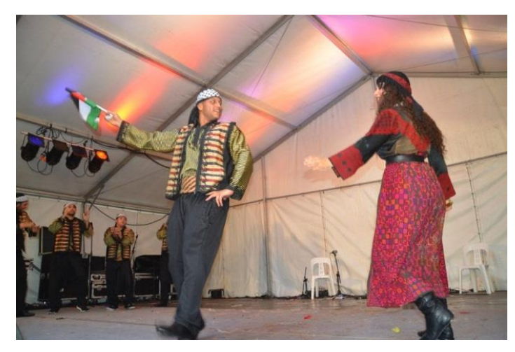
Dancers at Multicultural Festival in Canberra

The National Multicultural Festival is one of the most important cultural festivals in Australia, attended by more than 300,000 visitors from all Australian states and territories. Palestinian participation in this festival was highly distinctive and reflected the unique and vibrant culture of Palestine.