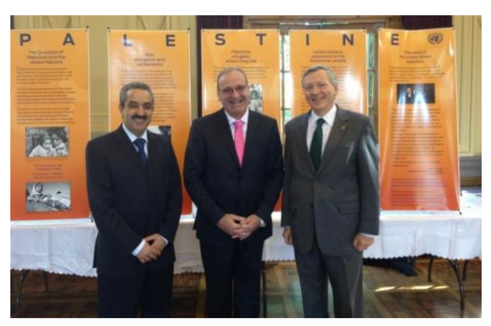
Ambassador Abdulhadi and the guests

12. The U.N. Information Centre (UNIC) in Canberra, in collaboration with the GDOP and the Council of Arab Ambassadors, observed the International Day of Solidarity with the Palestinian People on November 26. A significant number of the international diplomatic corps, including all Arab ambassadors, participated, together with academics, members of civil society, Palestinian advocacy groups and Australia's Muslim, Arab, and Palestinian communities. Speeches at the event were complemented by an exhibition of photographs and Palestinian handicrafts, as well as live world music from a group of talented young Australians.