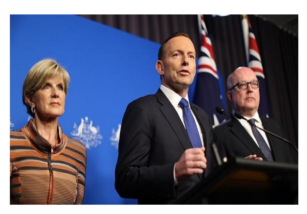
Prime Minister the Hon. Tony Abbott with Foreign Minister the Hon. Julie Bishop and Attorney General the Hon. George Brandis

Another significant development of 2013 was Australia's closer alignment with the Palestinian conceptual model on a solution to the final status issues. Additionally, Australia continued implementing its development agreement with Palestine, providing a contribution of approximately 60 million dollars annually. These actions showed a distancing in the decision-making of Australia from the United States. An independent decision-making process for Australia was emerging. The result of this was a clear move toward a multilateral position on solving the Israeli-Palestinian conflict and closer alignment with the international agenda on other global issues.