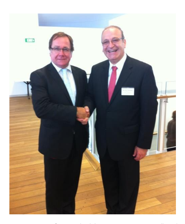
Foreign Minister of New Zealand the Hon. Mr. Murray McCully and Ambassador Abdulhadi

Other Middle Eastern issues were also discussed, particularly the conflict in Syria and the status of Syrian and Palestinians refugees within Jordanian, Lebanese and Turkish borders. In this context the Arab ambassadors called on New Zealand to provide additional relief aid to Syrian and Palestinian refugees, through methods such as support to involved governments, hosting refugees and through direct support to UNRWA.