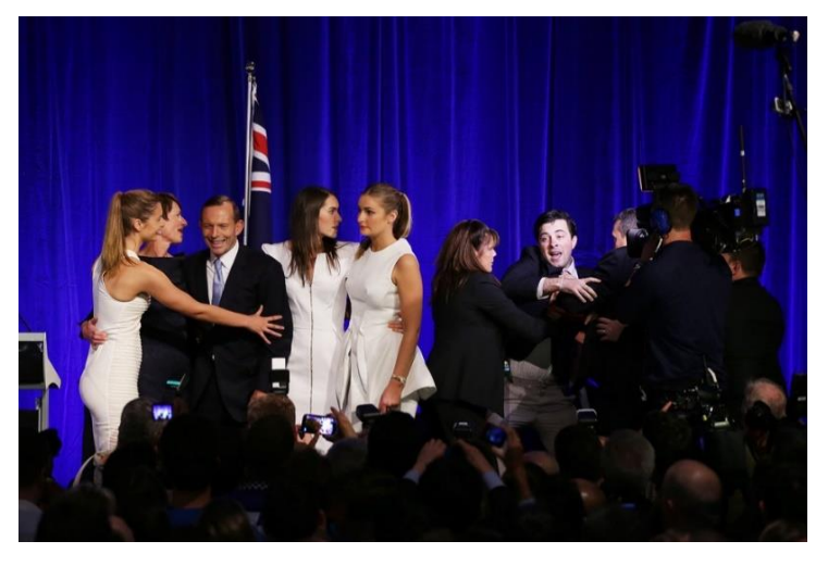
Prime Minister Tony Abbott and family celebrating victory