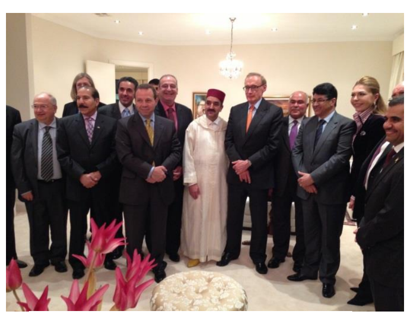
Ambassador Abdulhadi, Former Foreign Minister Bob Carr and the Council of Arab Ambassadors

They also discussed the implications of the Arab Spring in Egypt, Libya and Tunisia and its impact on the Palestinian cause.