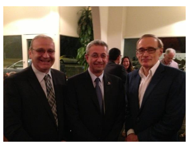
Ambassador Abdulhadi, and Former Foreign Minister Bob Carr

19. The Palestinian Ambassador participated in a study day focused on Australian foreign and security policy analysis organised in Canberra on November 21 by the Australian Institute of International Affairs, a think-tank close to DFAT. The Hon. Senator Bob Carr and of Mr Alexander Downer, Australian Foreign Minister for the Coalition government of 1996-2007 delivered key lectures during the event. The political adviser to the Prime Minister the Hon. Tony Abbott also gave an important speech. The day a wide range of debates and questions, including discussions raised by the Palestinian Ambassador on the changing pattern of Australia's voting in the U.N. This focused largely on Australia's abstention on the condemnation of Israeli settlement activities in the Occupied Palestinian Territories.