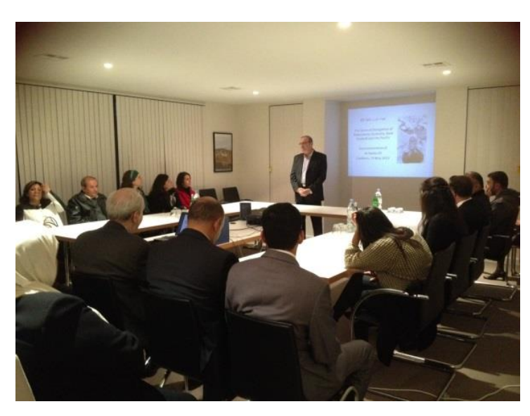
Ambassador Abdulhadi and guests discussing Nakba

7. The GDOP comprehensively covered the Nakba anniversary through a variety of activities, most importantly a symposium at the GDOP's grounds on May 19, attended by many members of the Arab and Palestinian communities. A film about the Nakba was screened and extensive discussion on the Nakba occurred, including its causes, effects, and lastly how to overcome the effects of the catastrophe and establish a Palestinian state with its capital as East Jerusalem.